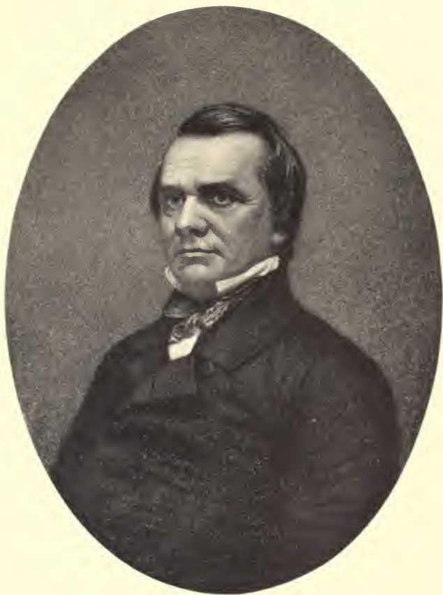
STEPHEN A. DOUGLAS